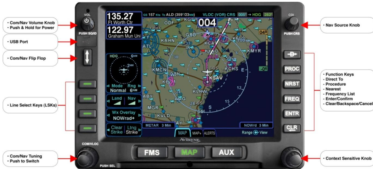
• Page Function Keys

*The IFD510 and IFD545 do not contain a VHF nav/com radio and therefore does not have a volume knob, flip/flop button, and Com/Nav push knob.